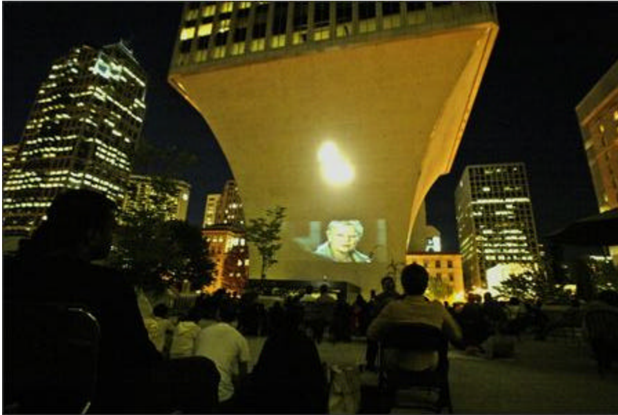
"Casino Royale" is projected onto the base of the Rainier Tower for Movies on the Pedestal night. The free series takes place every Thursday night.

http://seattlepi.nwsourc.com/lifestyle/326337_seenscene04.html